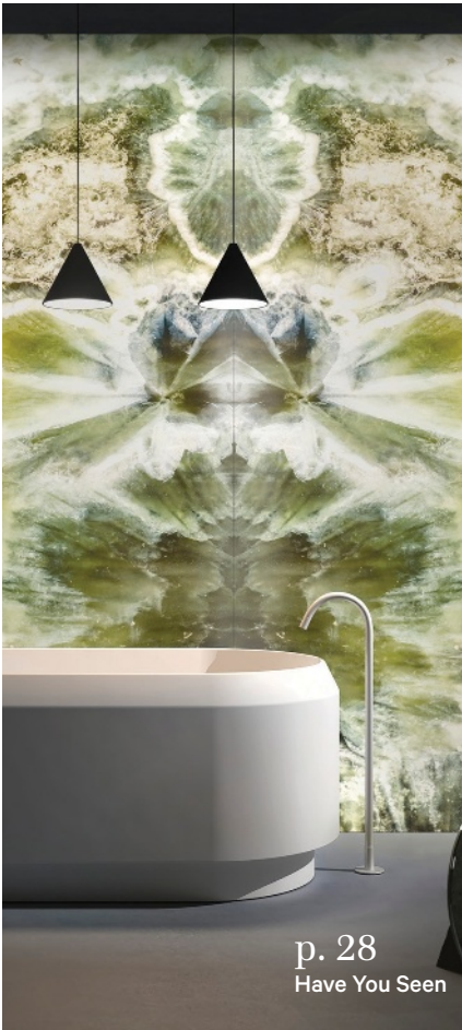
On the cover: Artline Group president Puneet Bhasin.

42 SUSTAINABILITY Recapping NEWH Green Voice sessions at BDwest