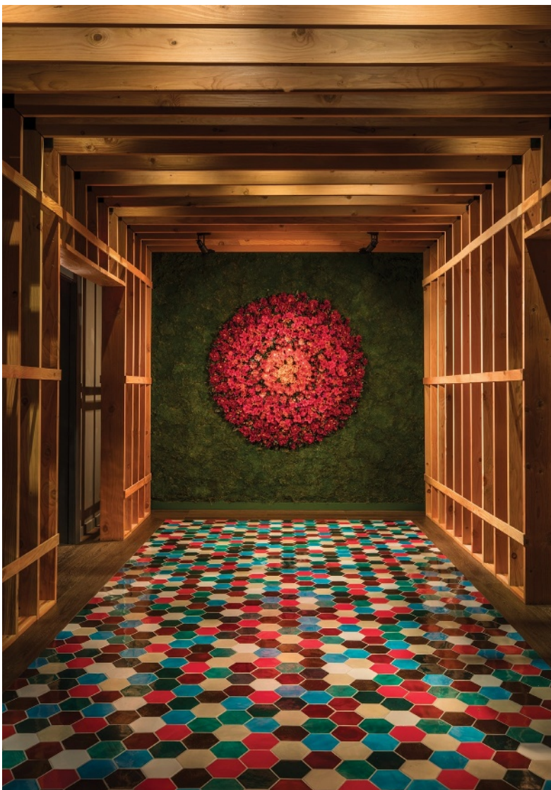
Left: CVLTVRA's entry is marked by a vivid red installation made from dried flowers and silk, and colorful, hexagon-tiled flooring.

Considering the vast size of the square-shaped room, unified by 18-inch-wide striped plank flooring, Fortis broke it down into a number of fluid transition zones and "went as large scale as we could," with certain elements to foster even further intimacy. White subway tiles, for instance, are graced by a smattering of artful, 7-foot-tall spearheads. One can sit at a communal table beside a column clad in tiles of various shades of soothing green, or in the mustard yellow leather banquette set against a tropical wallcovering showcasing oversized palm fronds and banana leaves. And to spark a