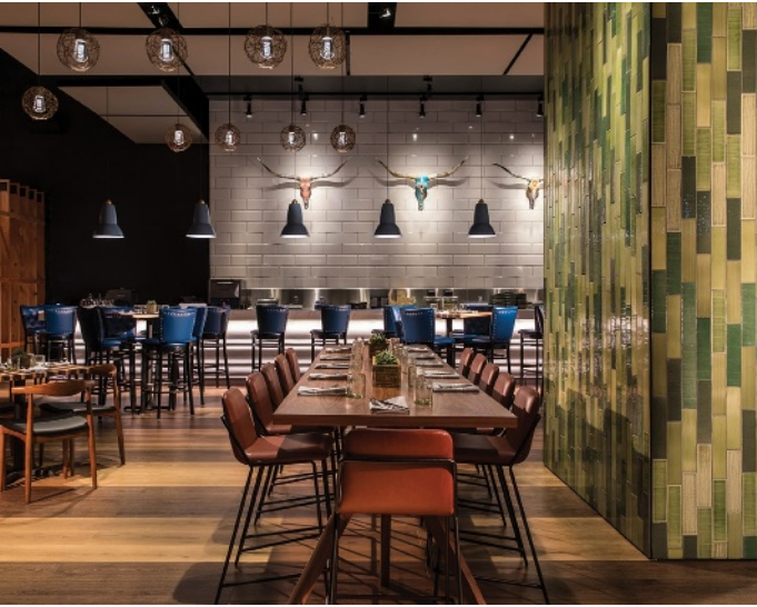
This page: White subway-tiled walls are adorned with Latin-influenced art, and green accents abound in plants and a tropical-style wallcovering that backs the long, yellow banquette seating.