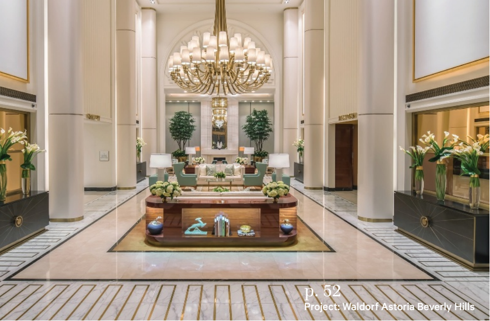
p. 52 Project: Waldorf Astoria Beverly Hills