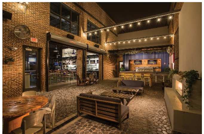
Clockwise from above: Large lettering at the front of the bar emphasizes “the cube,” which adds layers to Township’s interior; outside, the garden features stamped concrete that looks like cobblestones, living walls, and red-and-white corrugated aluminum accent panels.