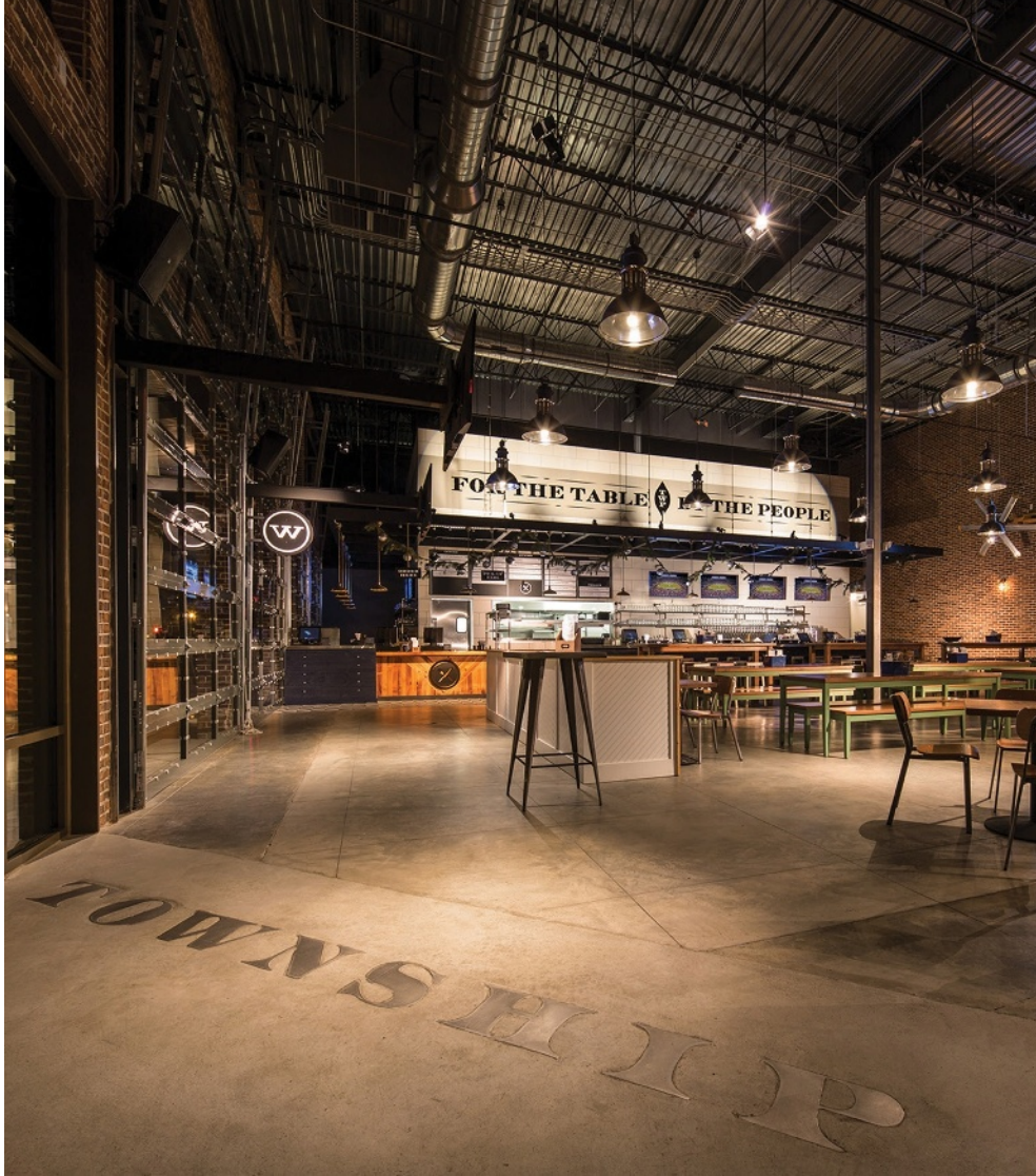
This page: Soaring 25-foot ceilings continue the industrial aesthetic, as do oversized porcelain tiles and simple wooden tables and benches.