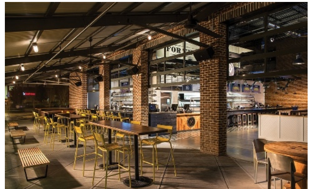
Opposite page: Meant to blend into its former train yard surroundings, Township features a red brick exterior, rollup garage doors, and large windows that mimic a warehouse.