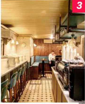
Londoners have mixed opinions about Victorian loo turned into a 'secret coffee shop'