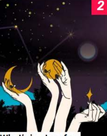
What's in store for today? Your horoscope for February 7, 2023