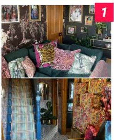
Woman adds £100,000 to value of home after experimenting for interior design business