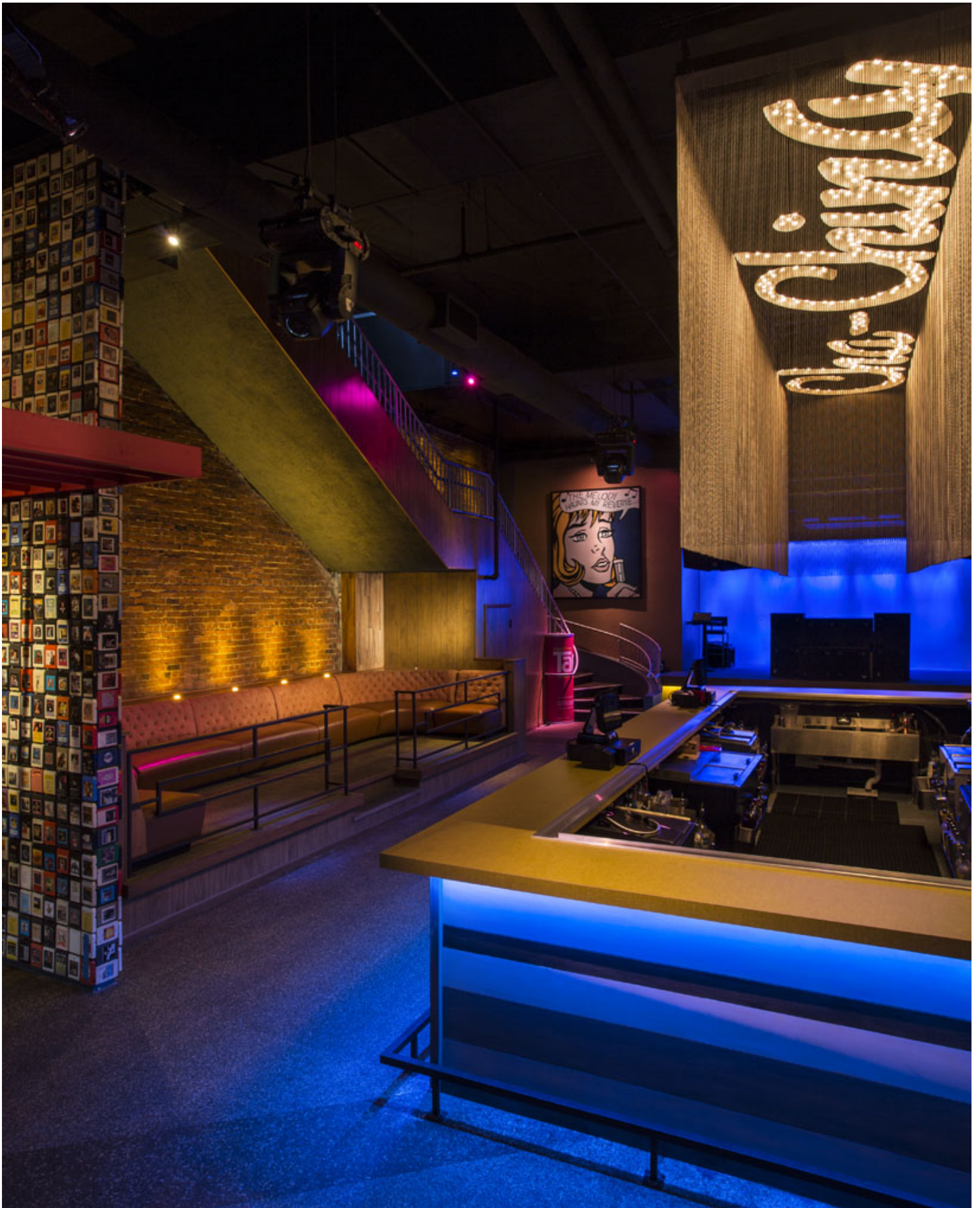
the over scaled elements are intentional to minimize other wise vacuous space