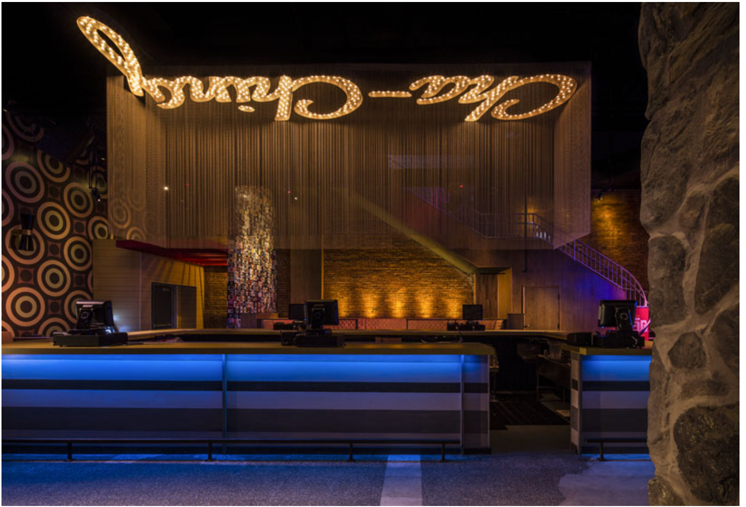
the marquee does double duty as both a chandelier and lighting effect