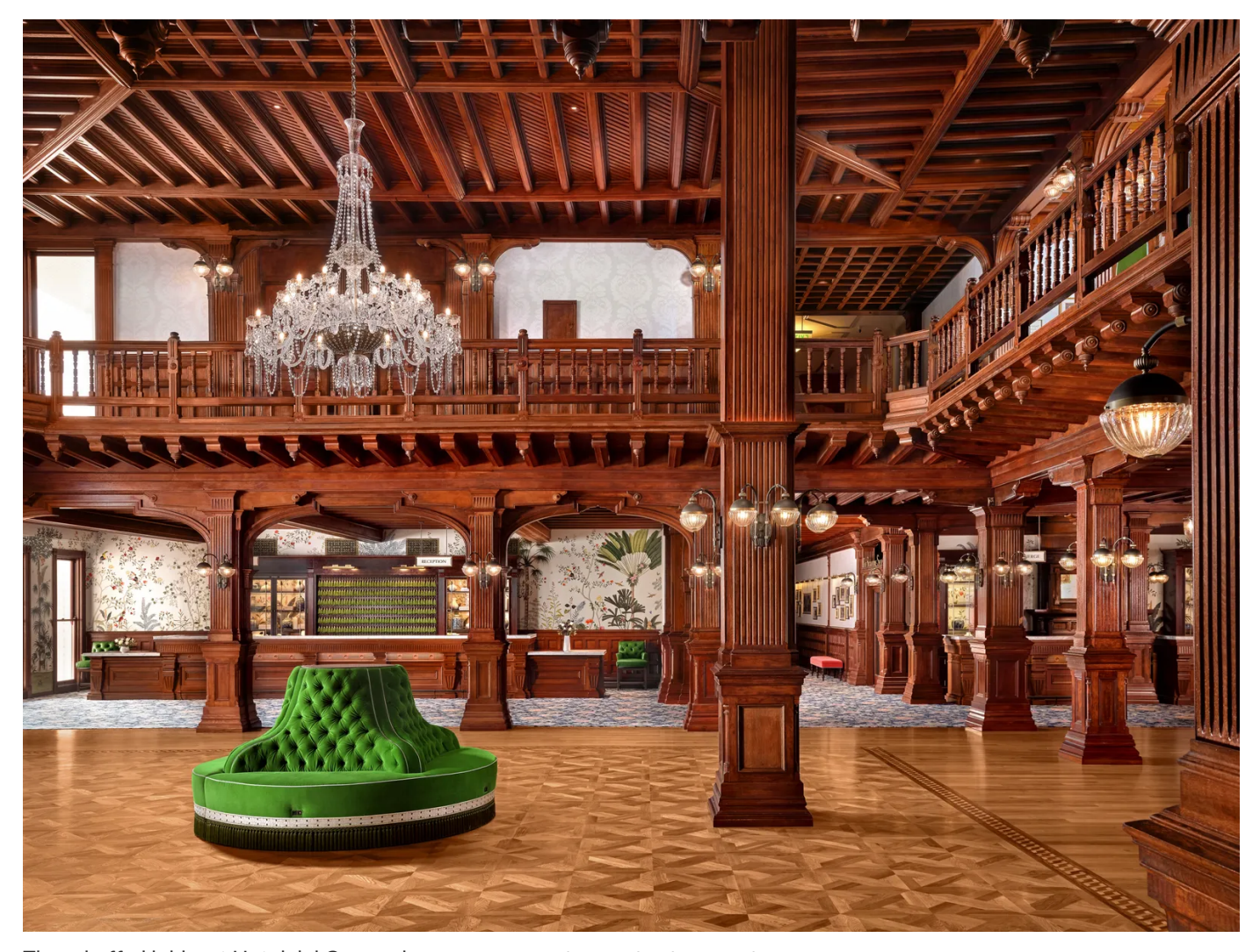
The rebuffed lobby at Hotel del Coronado.

for anyone who's visiting from out of town," he says.