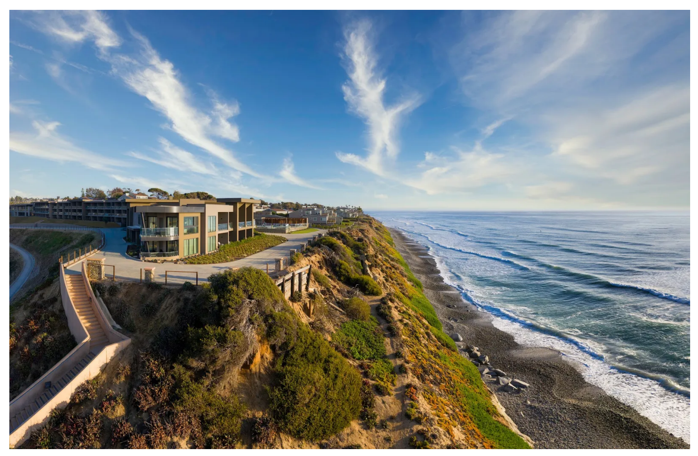
A view onto the Alila Marea Beach Resort.

Leaving the main city and looking to the areas surrounding it, <u>Hotel del Coronado</u>, in Coronado, is getting heads to turn. Open since 1888 and designated a National Historic Landmark in 1977, the legendary property is amid a $400 million renovation that's debuting in phases. In August, the beachfront resort unveiled a new main entrance and lobby with 21 stained glass windows and updated Victorian-inspired decor. One of Hotel del's buildings, The Views, has also been redone with new guest rooms as has the Windsor Lawn, which overlooks the Pacific and has new turf, trees, and lighting.