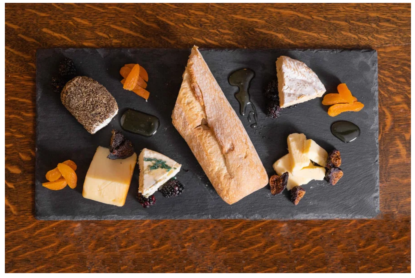
The cheese slate offered at the hotel's new Plunkett Lounge.

The mansion now offers 5,000 square feet of function space for social events. The Hawthorne Music Room accommodates 150 guests, and the Wharton Ballroom fits 170.