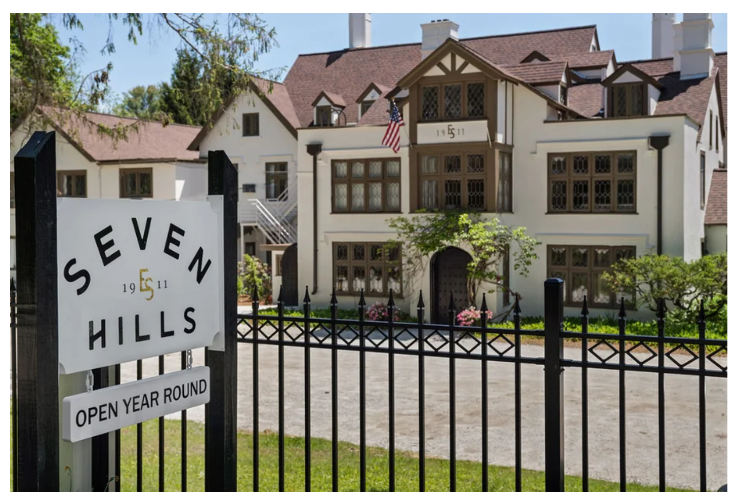
The entrance sign to Seven Hills in Lenox.

Guests can now stay year-round at Seven Hills , a 1911 Gilded Age mansion in Lenox that boasts new furnishings and guest bathrooms, as well as new dining options, common areas, event spaces, and a children's club.