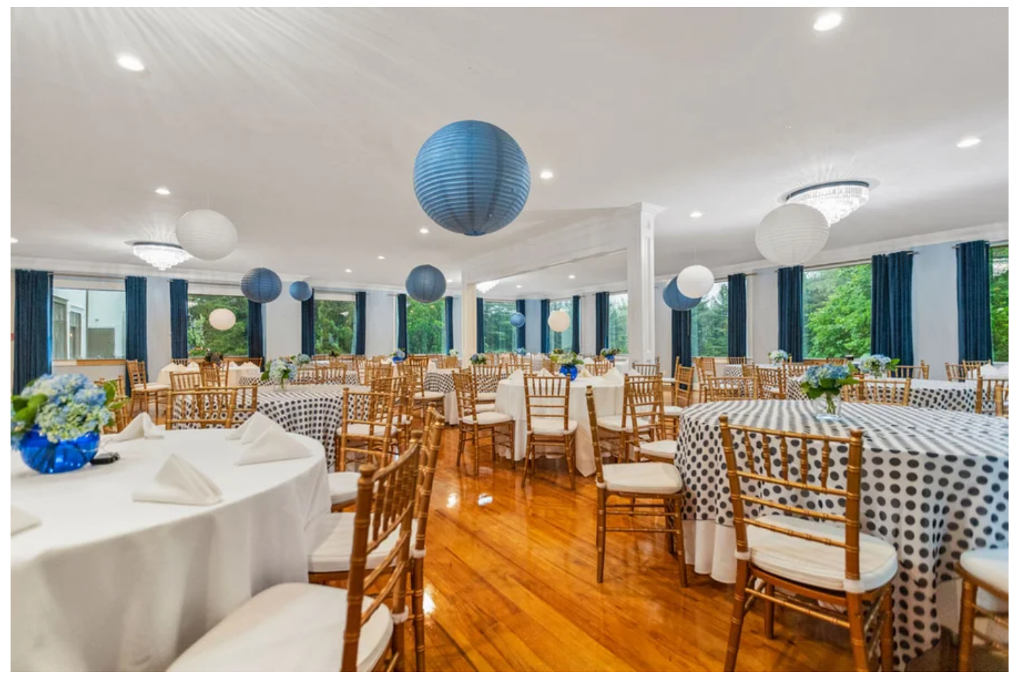
The ballroom at Seven Hills.

Guests who want to hang out outside on the patio can enjoy al fresco gatherings around a cozy fire.