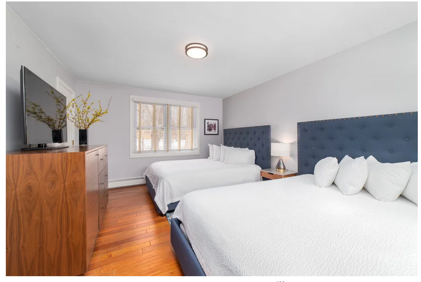
A queen guest room at Seven Hills.

The king and queen beds have upholstered headboards and down-alternative blankets and the bathrooms are furnished with marble-topped sinks, hexagon and subway tiles, and offer either a shower or a shower and tub combination. A new one-bedroom suite, called the "presidential suite," is ideal for couples who marry at the venue and features a bathroom with a separate soaker tub and rain shower.