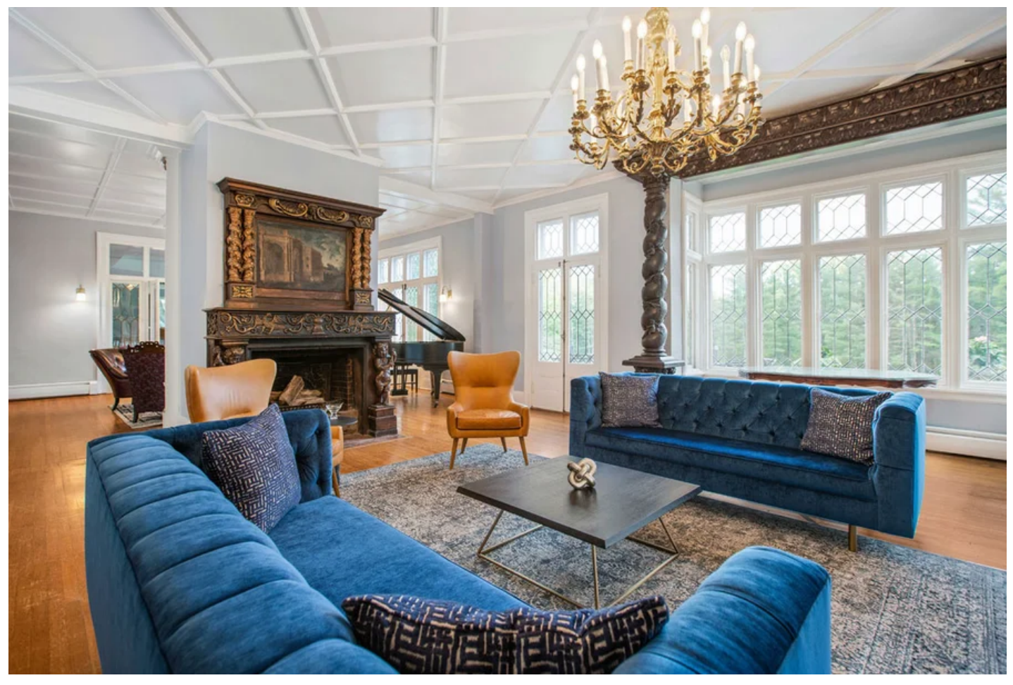
A sitting room at Seven Hills.

Guests can order food in the new Plunkett Lounge, which offers a small plates menu, seasonal craft cocktails, craft beers, and a curated wine selection. A cheese slate featuring a selection of regional cheeses, dried fruit, honey, and bread is also available. A signature cocktail called "Shipton Court" (the mansion's former name) is made with lavender essence, fresh lemon juice, prosecco, and a fresh lavender sprig.