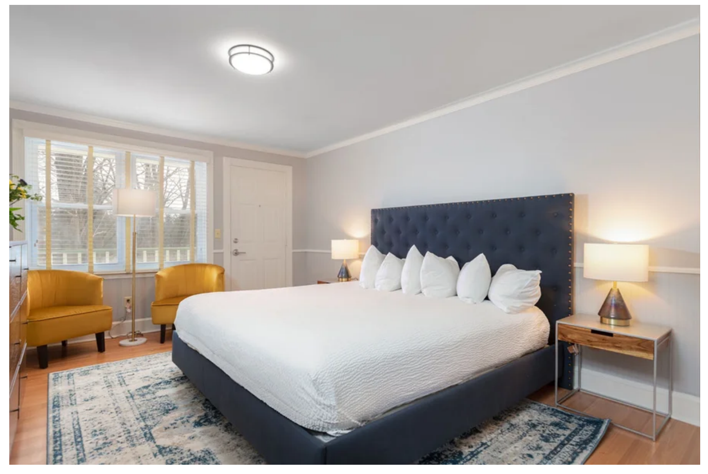
A king guest room at Seven Hills.

The hotel's rooms all have private bathrooms and are spread out among three buildings: Manor House, Carriage House, and Terrace House. They have been redone in charcoal and blue with touches of mustard and gold and have hardwood floors.