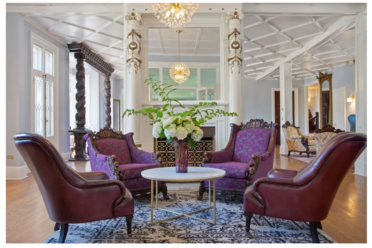
A sitting area at Seven Hills.

The hotel's common areas have been updated in gray, slate, and deep royal blue, with amethyst accents. Guests can relax on modern couches and chairs made of velvet and leather upholstery.