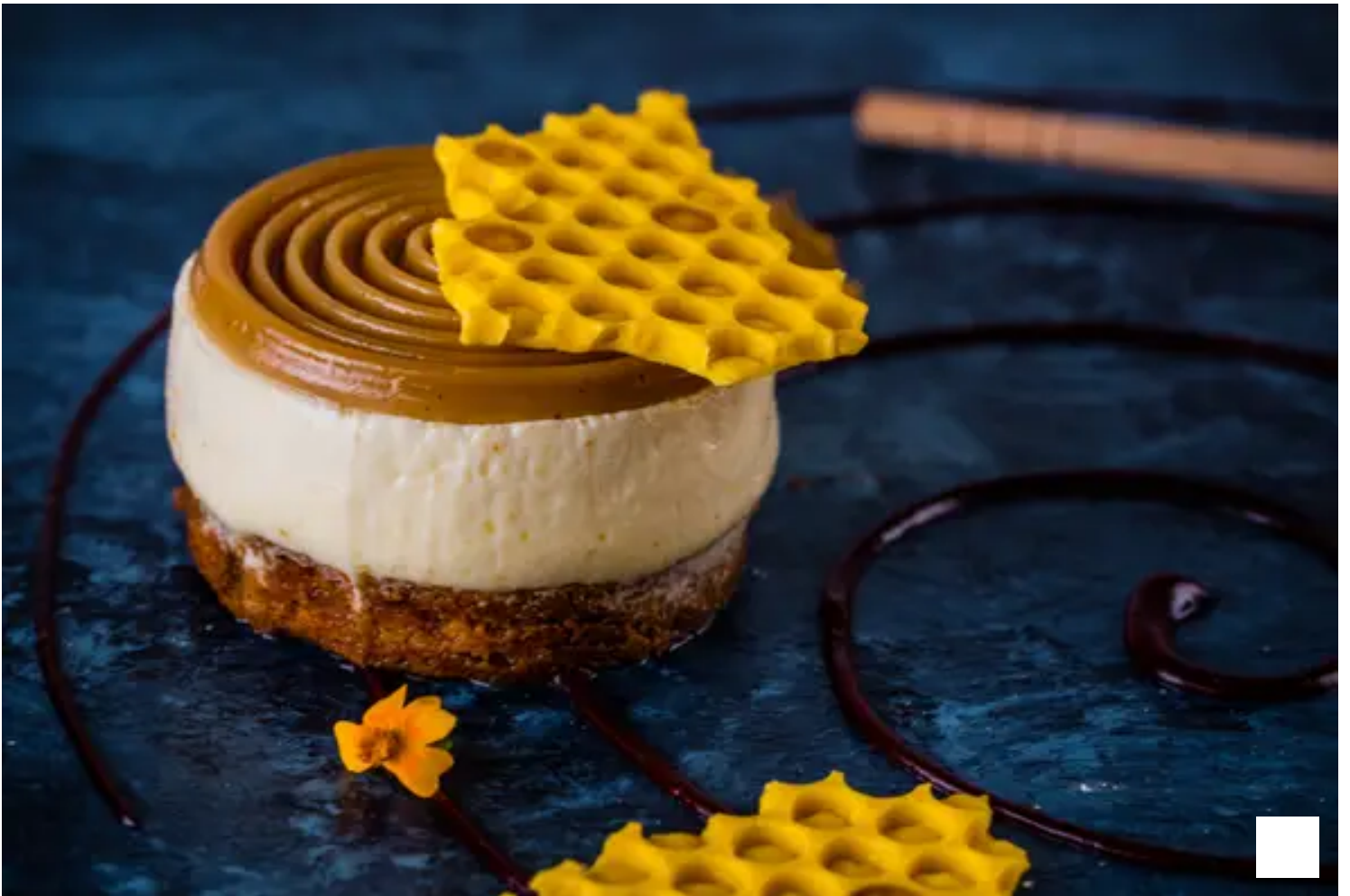
Cheesecake served at the Beacon, a modern American grill at Charlie and Joe's at Love Street.