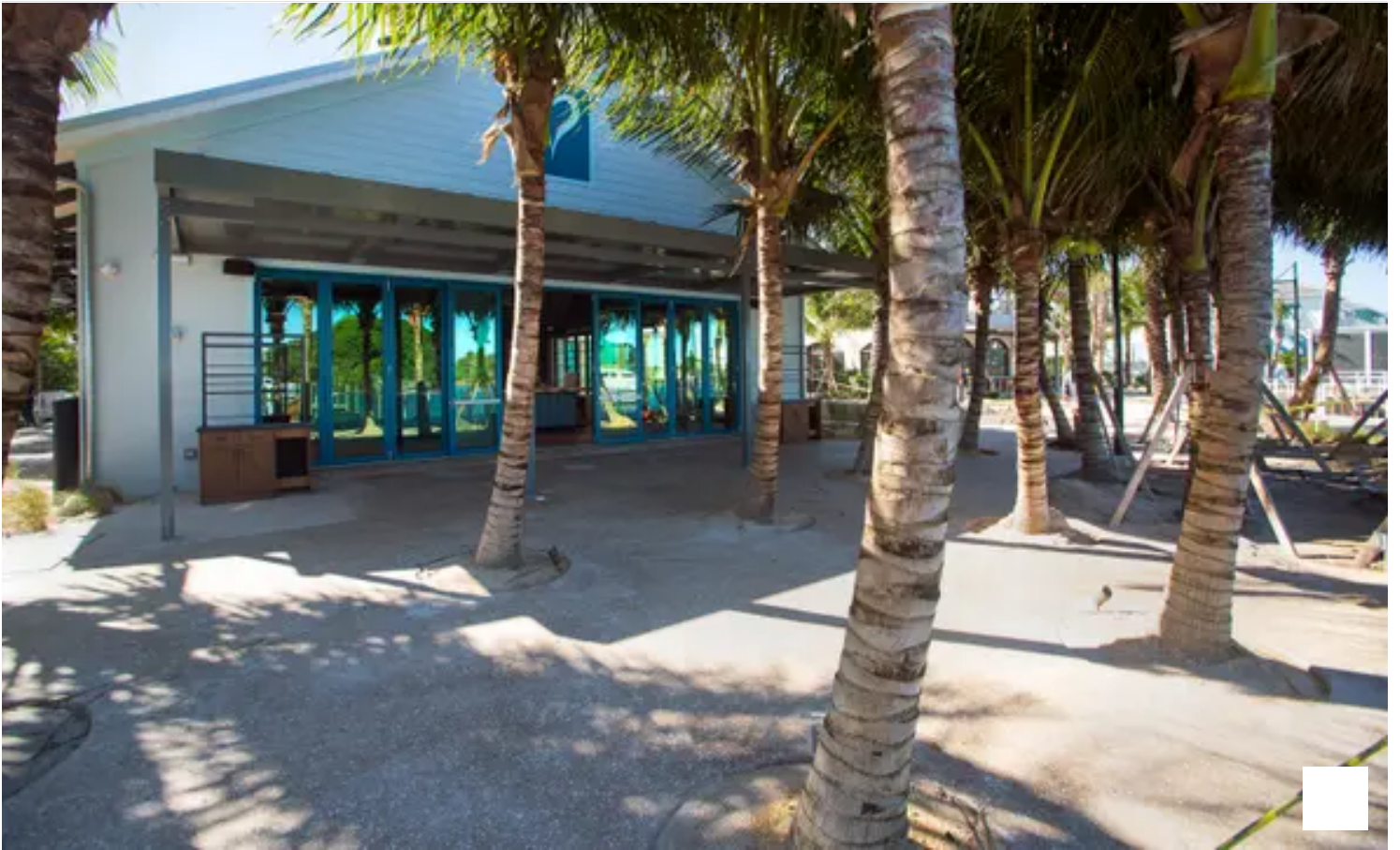
An exterior view of Lucky Shuck oyster bar at the Charlie and Joe's at Love Street complex in Jupiter. The restaurant sits next to the building that houses two other related restaurants, Beacon and Topside.