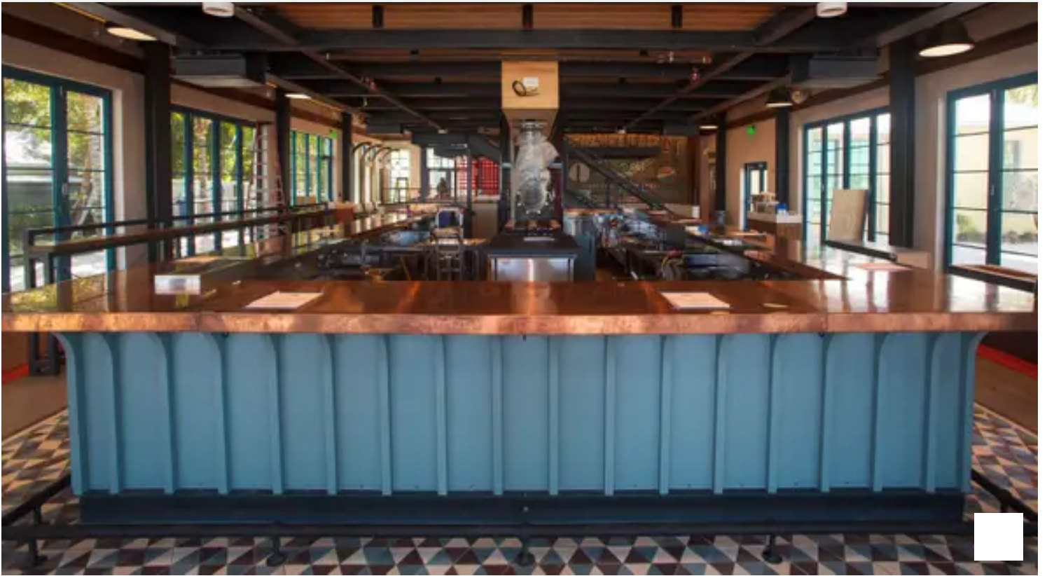
A view of the bar at Lucky Shuck, an oyster bar and taproom at the Charlie and Joe's at Love Street project.