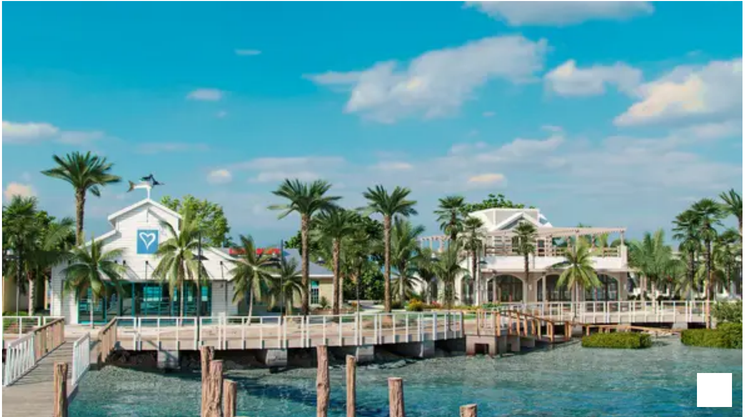
An artist's rendering of the Jupiter waterfront complex known as Charlie and Joe's at Love Street.