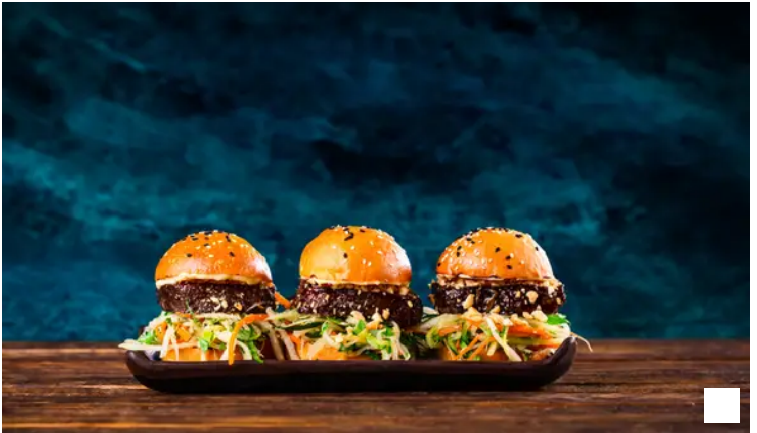
Joe's Beef Short Rib Sliders served at Topside, a rooftop tapas bar at Charlie and Joe's at Love Street in Jupiter.