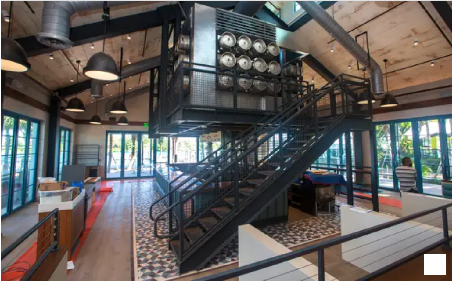
The mezzanine area inside Lucky Shuck oyster bar is used to store the tavern's keg coolers. Raw bar offerings and craft beer are a focus of the restaurant, which is one of three at the Charlie and Joe's at Love Street complex in Jupiter.