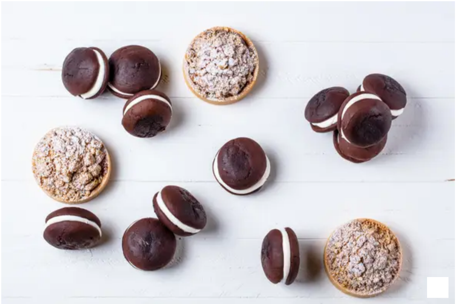
Whoopie Pies and Pie of the Day offered at The Tacklebox, the seafood market at Charlie and Joe's at Love Street in Jupiter.