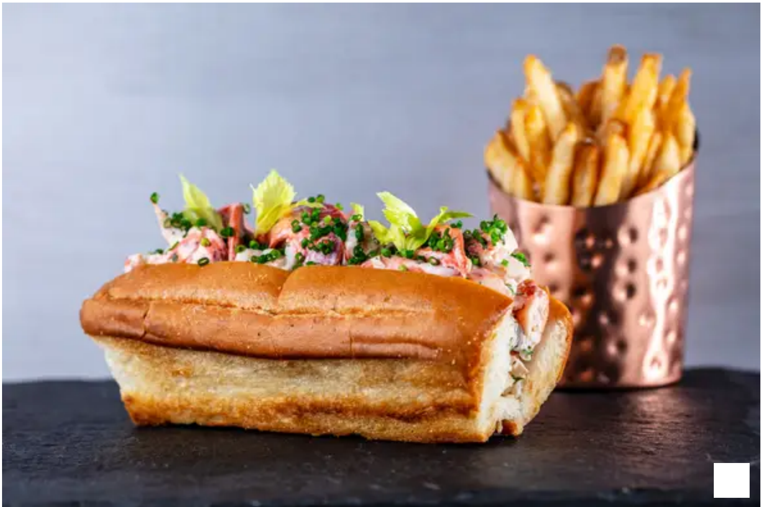
The Lobster Roll served at Lucky Shuck, the oyster bar and taproom at Charle and Joe's at Love Street in Jupiter.