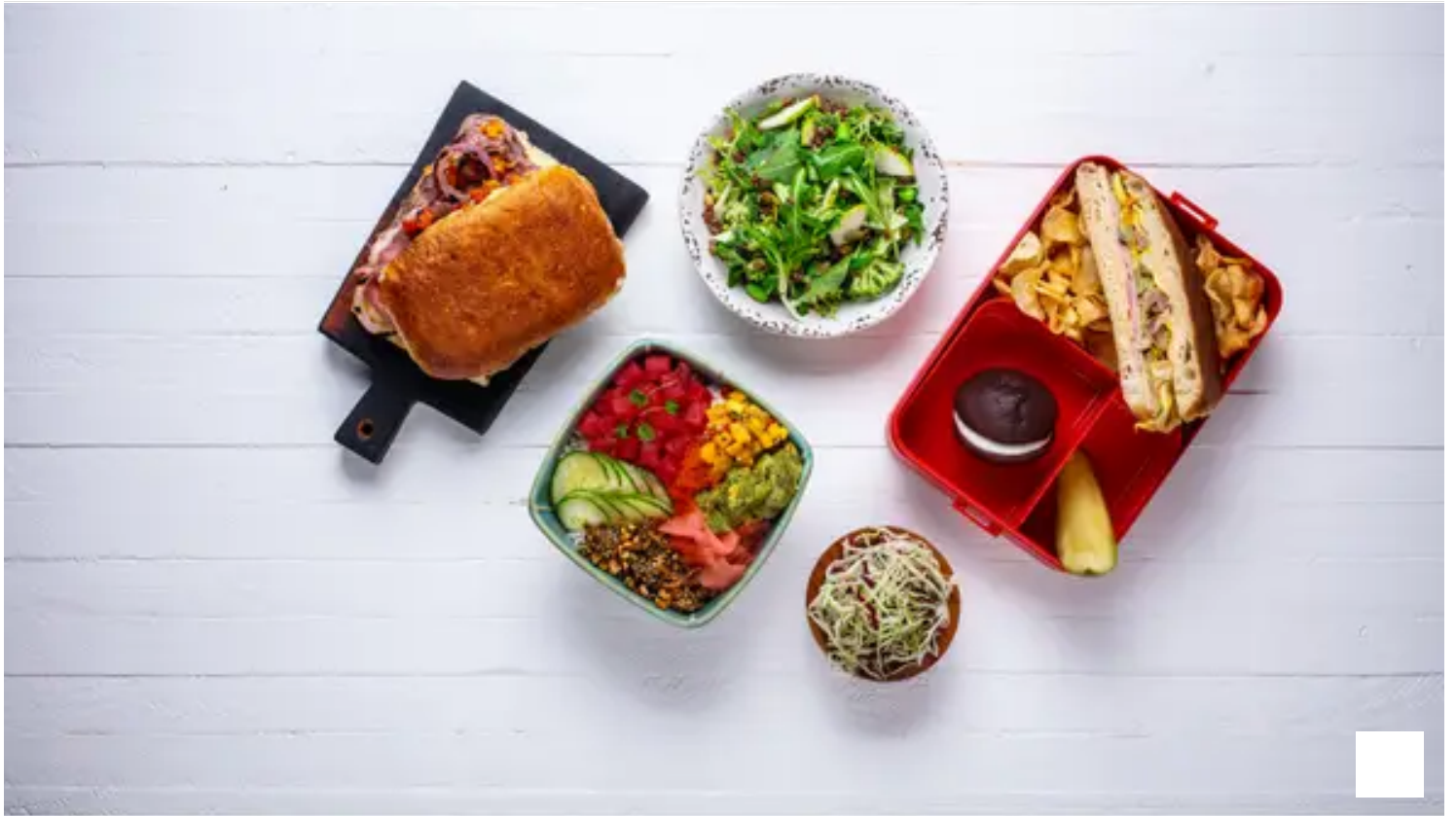
A variety of dishes available at The Tacklebox, the seafood market at Charlie and Joe's at Love Street in Jupiter.