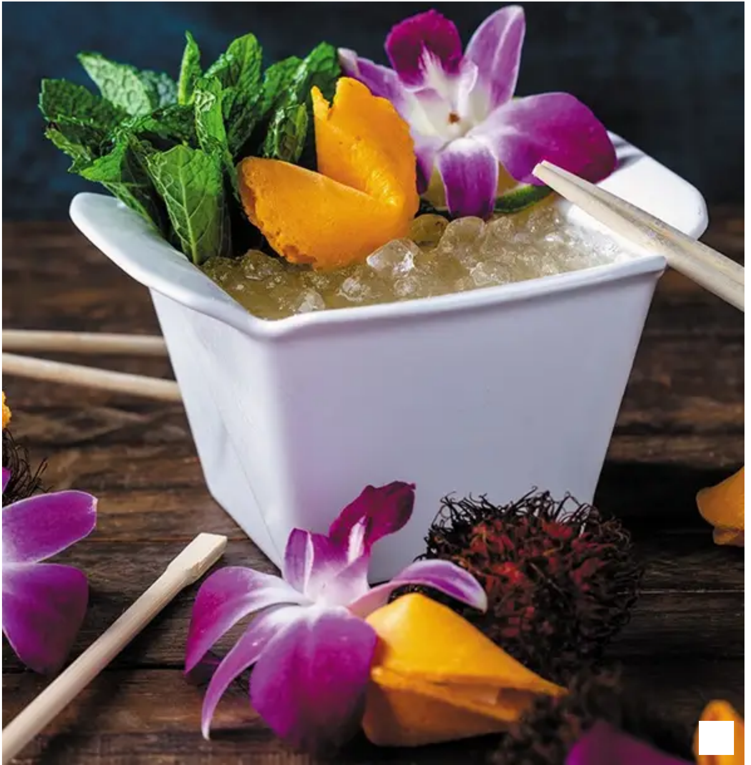
The General Tso's Downfall cocktail at Topside, one of the three eateries on deck to open at Love Street in Jupiter.