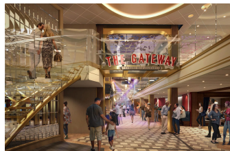
( https://carnival-news.com/wp-content/uploads/2022/06/content/uploads/2022/06/01_G11-P-min-scaled.jpg )