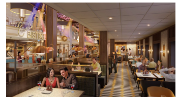
( https://carnival-news.com/wp-content/uploads/2022/06/content/uploads/2022/06/01_Gateway_Entry_w_people_c1-scaled.jpg )