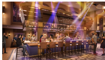
( https://carnival-news.com/wp-content/uploads/2022/06/content/uploads/2022/06/01_Gateway_Entry_w_people_c1-scaled.jpg )