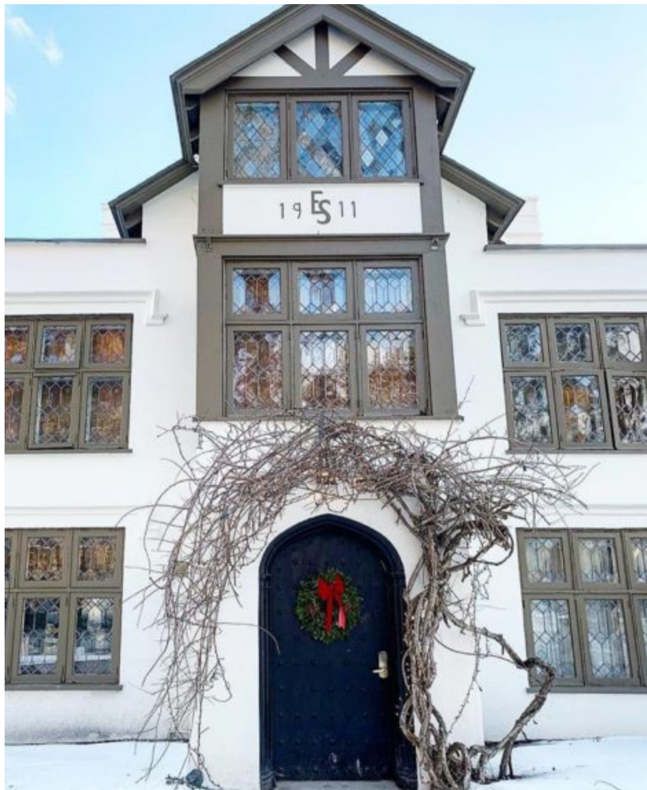
The front door of the Manor House at Seven Hills in Lenox, which is currently undergoing a design upgrade.