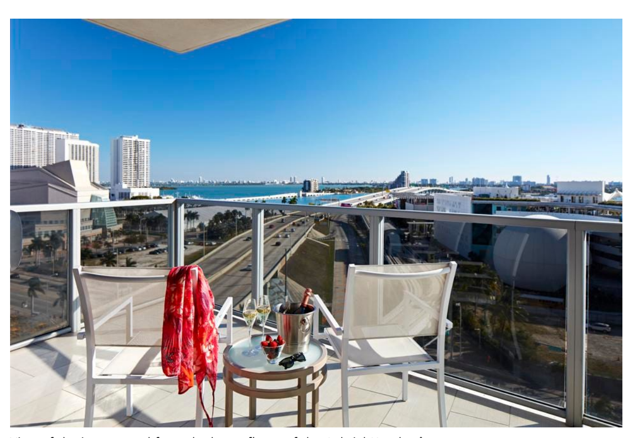
View of the intracoastal from the lower floors of the Gabriel Hotel.

The view from The Gabriel is interesting in that the east-facing rooms provide an expansive lookout over many parts of the city - the downtown skyline to the south, the cruise ship ports straight out in front, and then the island of Miami Beach off in the distance.