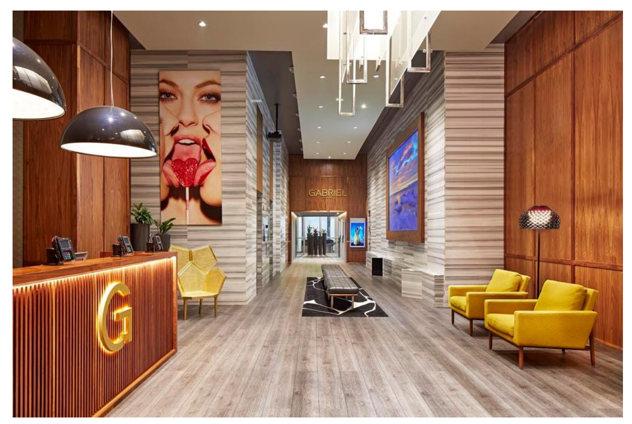
The artwork of the Gabriel Hotel in Miami.

If you're in town to see a concert or a Heat game, then the Gabriel is in the perfect location. You can see the American Airlines Arena from the hotel, making it very easy and convenient to walk right over. It's also within a reasonable distance of other main attractions, including Miami Beach (10-15 minute Uber ride) and Wynwood (same). Of course, you can simply step out the front door and walk easily to the bars and restaurants in downtown Miami.