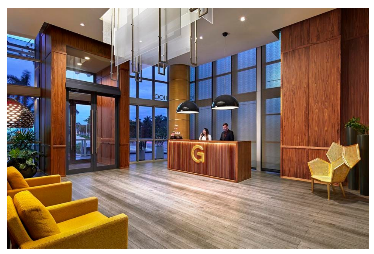
Lobby of the Gabriel Hotel in Miami.

Headed to Miami? There are many, many options of where to stay in the different parts of the city. But don't overlook the downtown area, where new