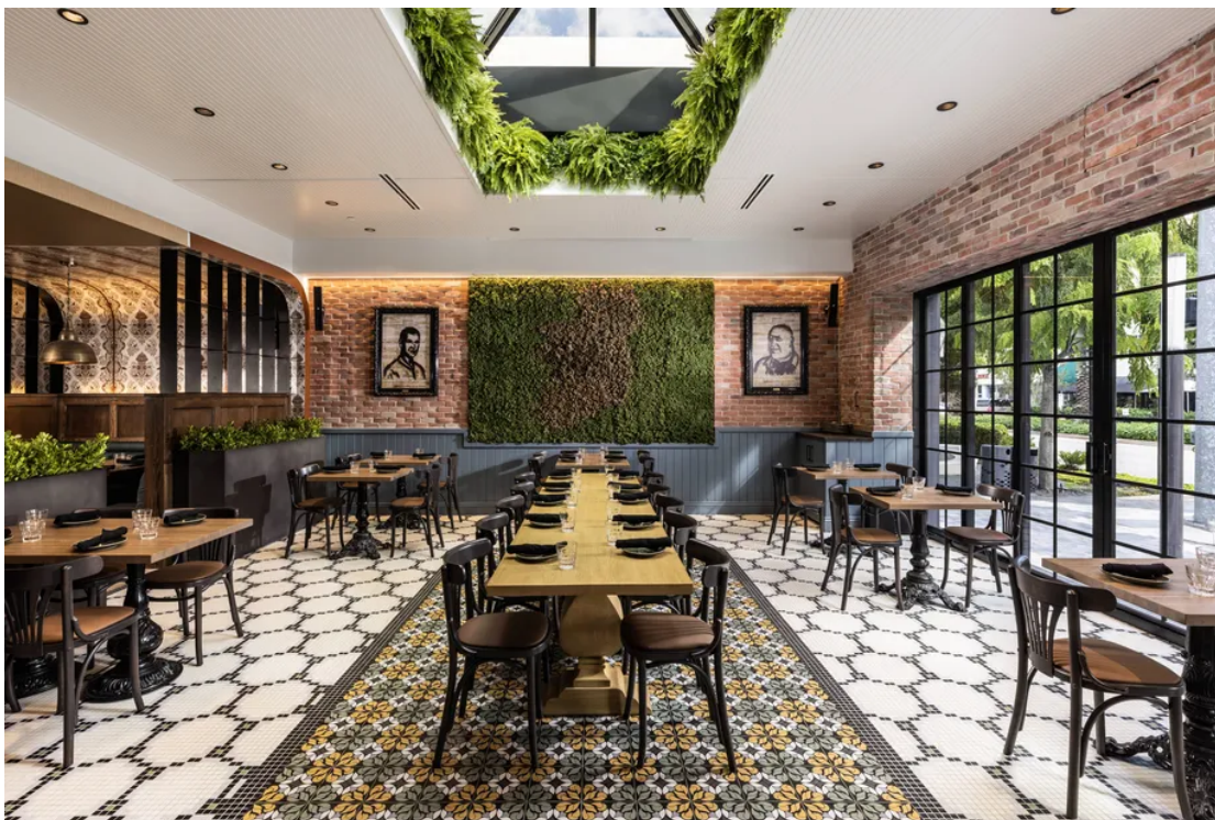
The newly added indoor "garden" at John Martin's complete with a sunroof.

two-story restaurant and bar has been redesigned by Bigtime Design Studios; the 7,000 square-foot venue pays homage to the original John Martin's while offering a more contemporary and family-friendly atmosphere. The space still features plenty of its original architectural elements, but it now showcases a black-and-white color scheme, a new indoor "garden," and a moss-covered brick wall bordered by portraits of the original founders John Clarke and Martin Lynch, who originally opened the bar on Miami's Miracle Mile in 1989 but are no longer involved with the restaurant.